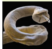
Electron micrograph of an adult lungworm

It is also known as the French/ small heartworm or lungworm (to distinguish it from Dirofilaria – the large heartworm found in mainland Europe and the USA).