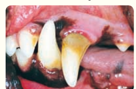
Photo of gum disease in an adult dog. Note the build up of yellow calculus.