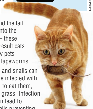
Lungworm photo: courtesy Bayer. Cat photos: Jane Burton.

Electron micrograph of an adult lungworm